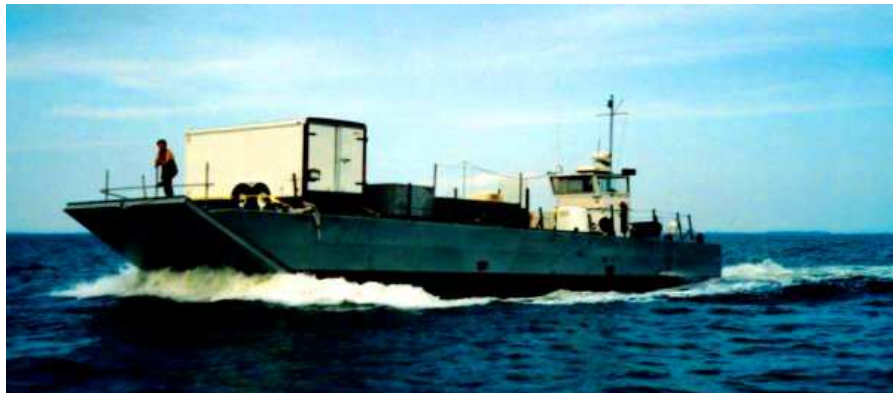
Figure 4. (U) Deployed on Chesapeake Bay