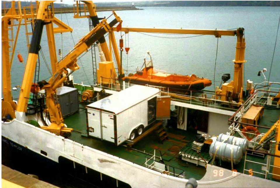
Figure 6. (U) Test bed deployed on R/V Colonel Templar for Cardigan Bay trials.