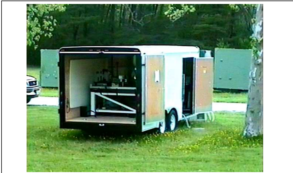
Figure 1. (U) OA test bed deployed at Fort Meade, MD Rifle Range