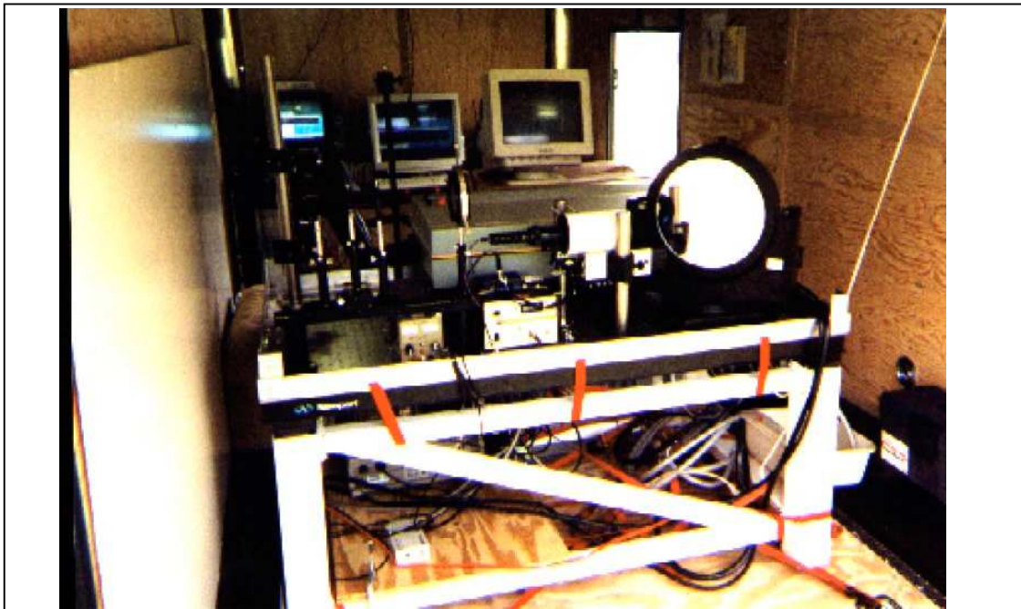
Figure 2. (U) Internal layout. (Note that the safety shield has not been installed yet)