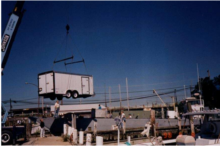
Figure 3. (U) Loading on LCM-8 for Chesapeake tests.