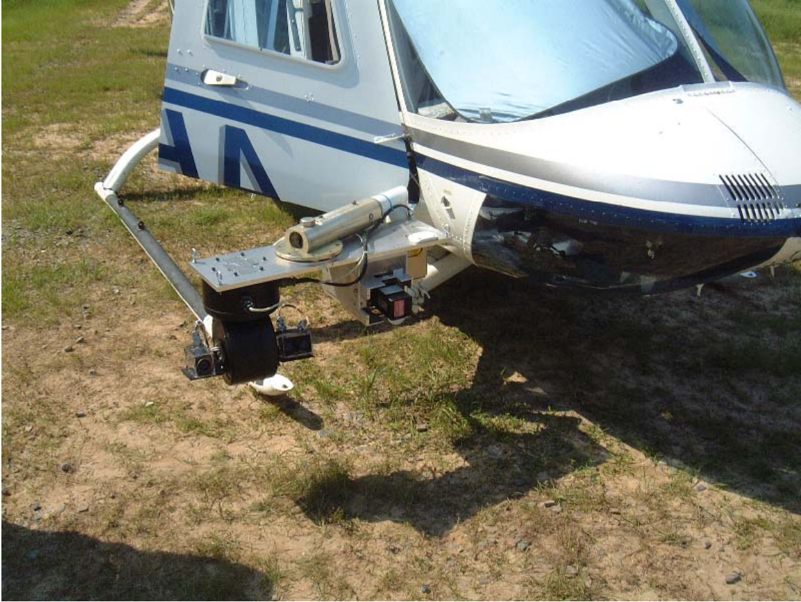
Figure 3 - Forward Eyes Test Equipment, Mounted on a Helicopter