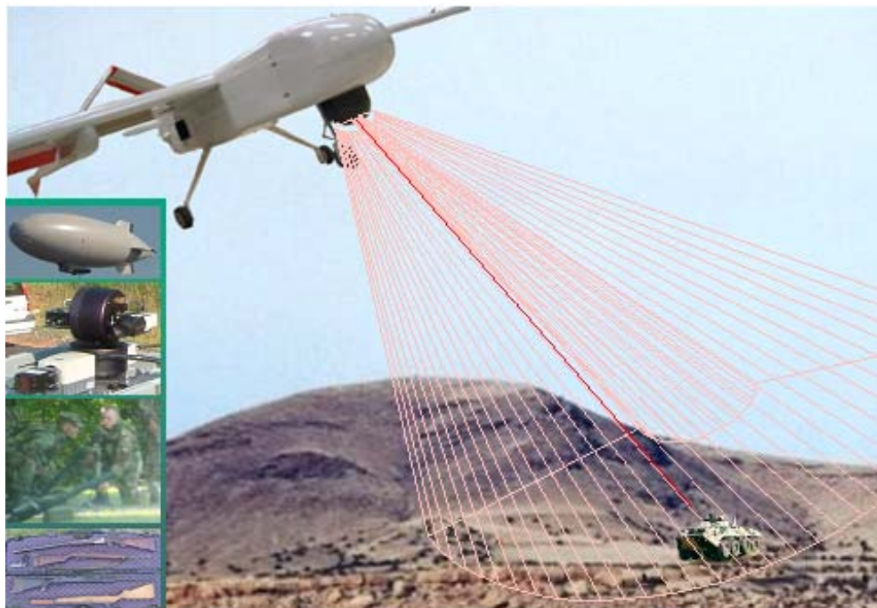
Figure 2 - Forward Eyes UAV Concept