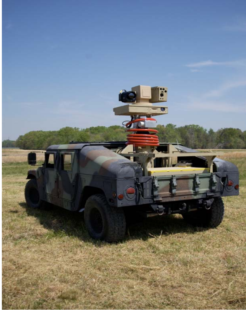
Figure 4 - GDL System for Operational Experimentation